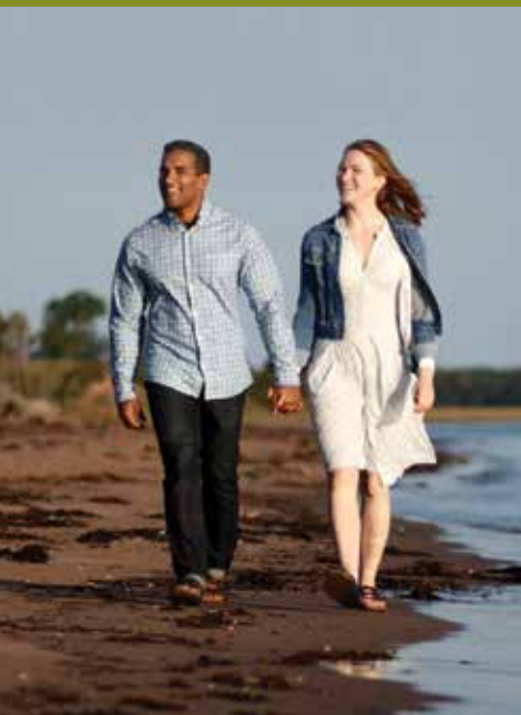
Walking the shores of the Northumberland Strait near Pictou Lodge Beach Resort

Build a beautiful life in Pictou County.