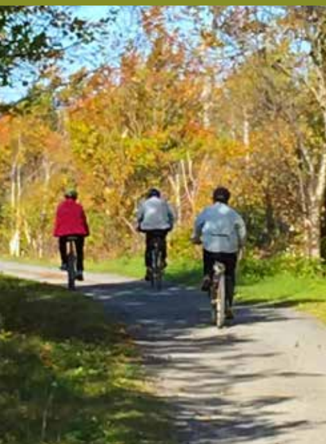
Cycling on the Jitney Trail in Pictou

Pictou County is a safe and supportive community to raise a family.