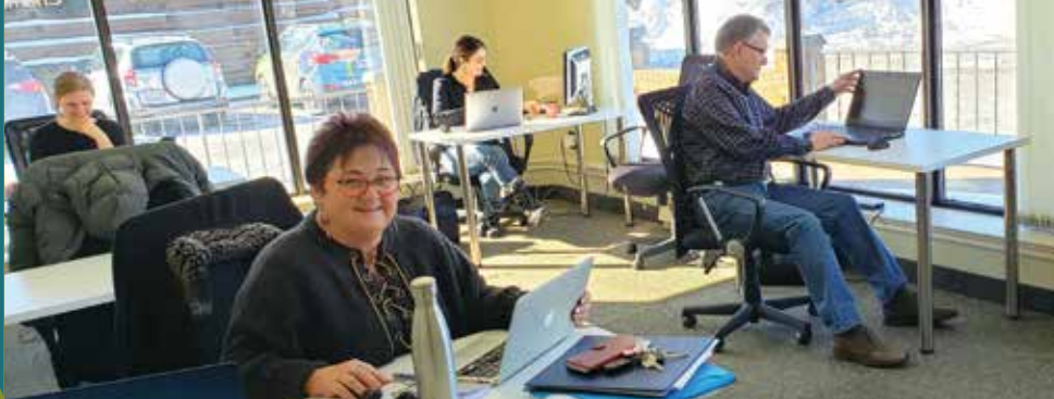
Pictou County Chamber of Commerce HUB space located in downtown New Glasgow

Pictou County is the perfect place to grow personally and professionally.