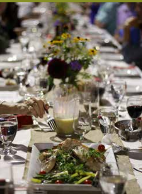
New Glasgow Farmers Market

1 One great community to raise a family with access to the Farmers Market, the deCoste Centre, Glasgow Square and nice restaurants